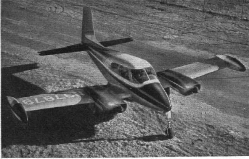
The new Cessna 310, in characteristic American paint finish, is probably the cleanest of all the twins.

The biggest of the group is the Beech B50 Twin-Bonanza, here seen over England while being tried by the Editor of "Flight."